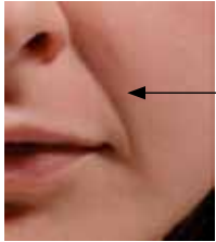
Figure 1. Facial Nasolabial Fold

BELOTERO BALANCE is used to smooth out and fill in the fold or wrinkle that goes from the side of the nose to the corner of the mouth (nasolabial fold) as shown in figure 1 below.